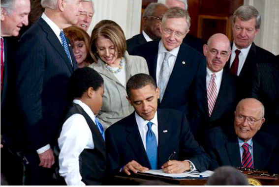
President Obama signs the Affordable Care Act into law on March 22, 2010.